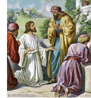
"Teach us to pray"