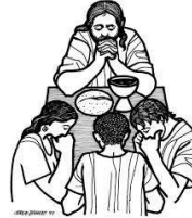
"This is my body"